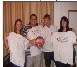
“The Geeks” show off their first place prizes

Thanks to our fantastic supporters who turned up to help raise money for Q.A.W.S. and specifically for Maisie’s surgery on 4 th May at Garvey’s . We made over QR2000 which went straight to the Vets to help Maisie and her broken leg (who is healing wonderfully and will be back up and running very soon!). Congratulations to the aptly named “The Geeks” who won first prize, and to the winners of the Wooden Spoons “Riyal Doha”. A great night was had by all with good food and lots of laughs.