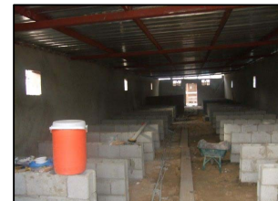
Phase One of the new kennels at Q.A.W.S.