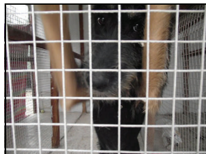
Table Top Treats

A very big thank you to all our volunteers who helped out on the day and to all those who helped make the afternoon such a success!